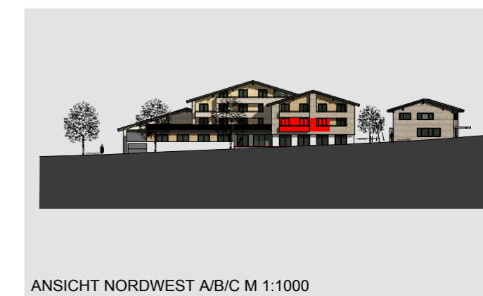
ANSICHT NORDWEST A/B/C M 1:1000